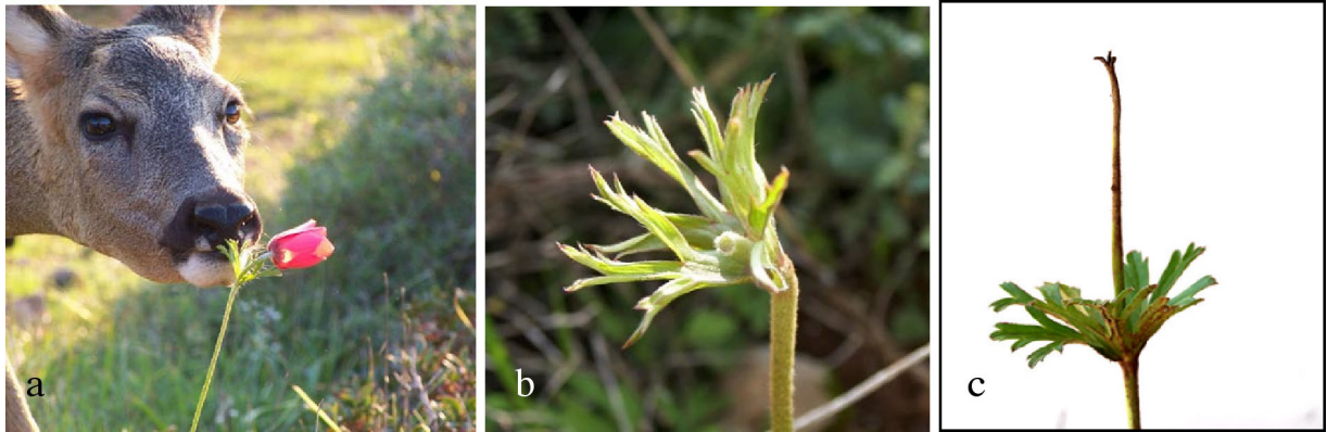
Fig. 1. (a) A roe deer about to consume an anemone flower. (b) An anemone that has been decapitated by roe deer. (c) An anemone that lost its flower by trampling or picking and thus does not have a precise cut.