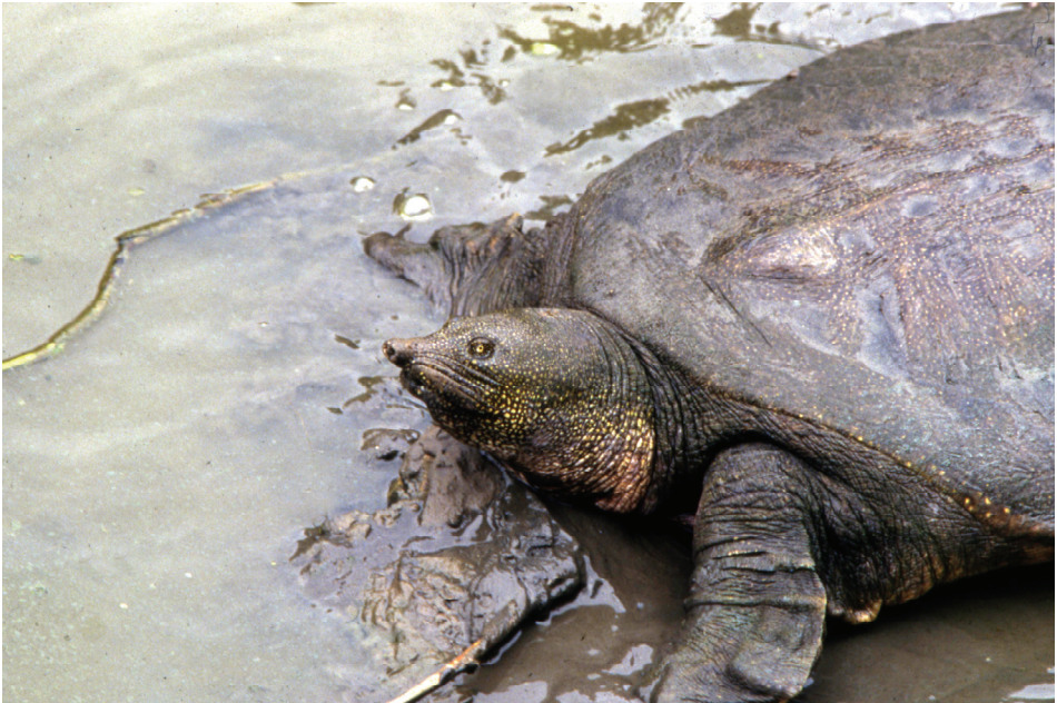
Fig. 2. Nile Soft-shelled Turtle, Trionyx triunguis , at Nahar Aleander, Israel.

using individuals from one of the main sites of occurrence (KASPAREK & KINZELBACH 1991) as a source.